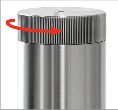
1. Unscrew the lid of the thermal barrier.