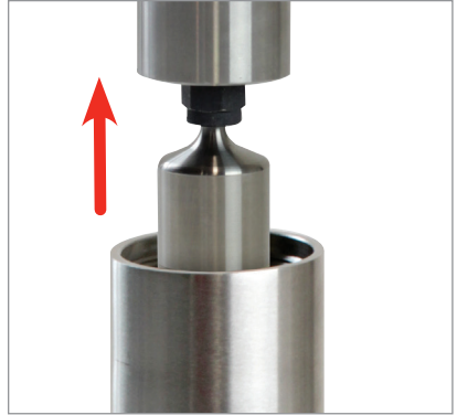
2. Slide out the data logger and lid from the barrier body.